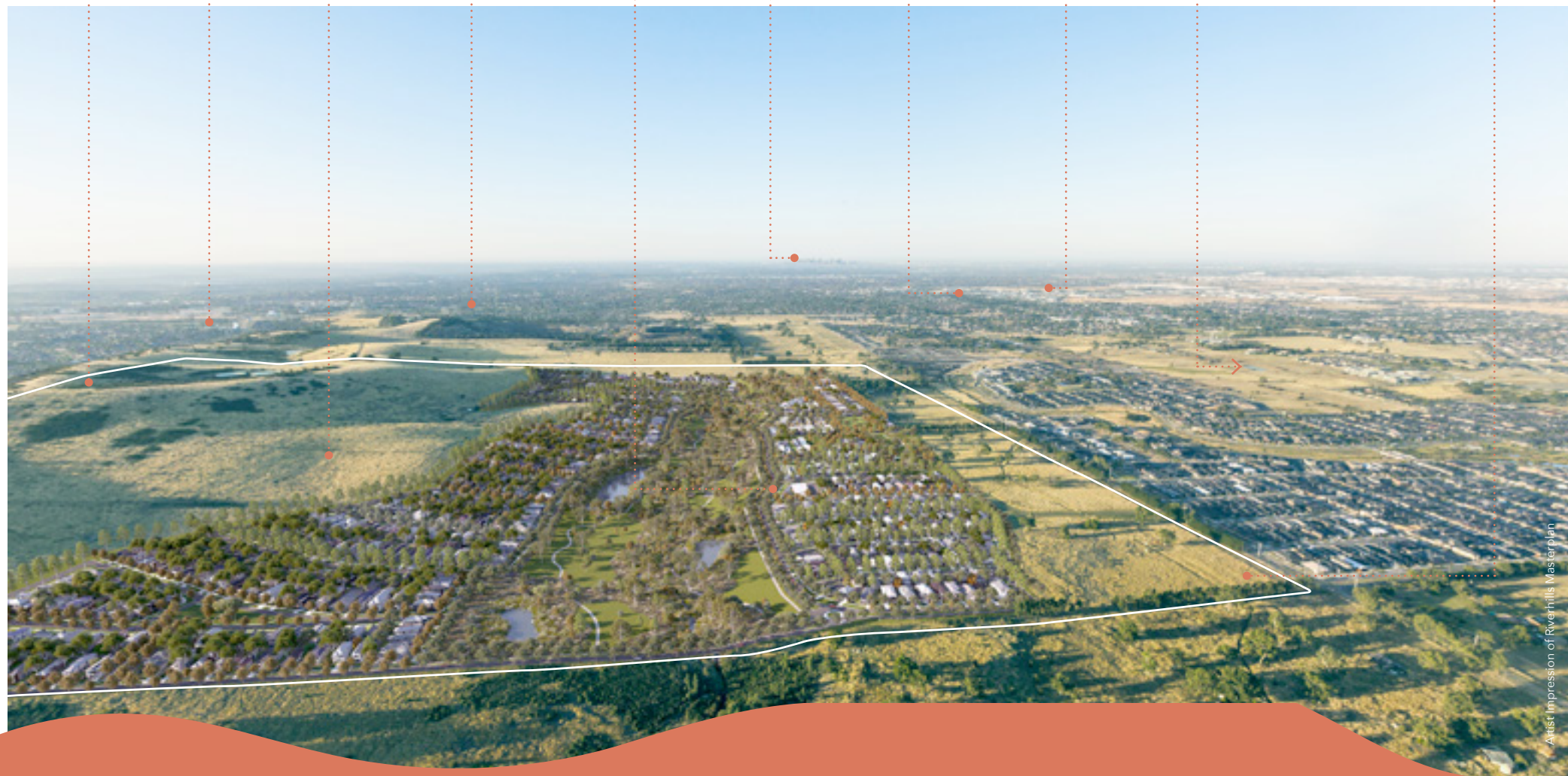
Artist Impression of Riverhills Masterplan

Getting where you need to be is easy, with the Hume Highway 5 minutes away plus the Metropolitan Ring Road and Melbourne Airport within 30 minutes drive.