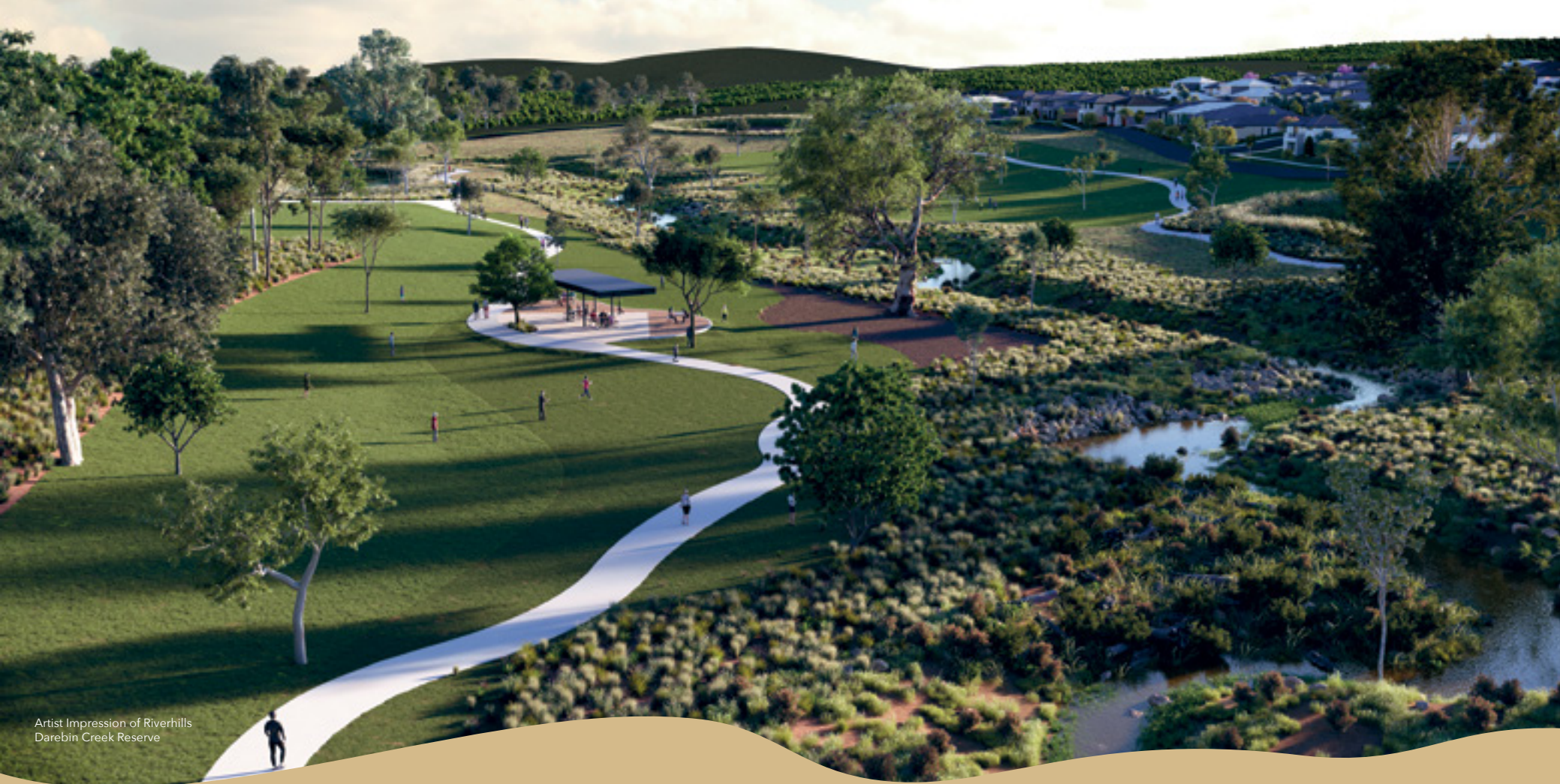
Artist Impression of Riverhills Darebin Creek Reserve

Every Enclave townhome is within walking distance of the sublime natural features that flow gently through the heart of the estate, so you will experience an uplifting connection to the natural environment. With a world of amenities nearby, you are also close to the lifestyle essentials we all need for ultimate contentment.